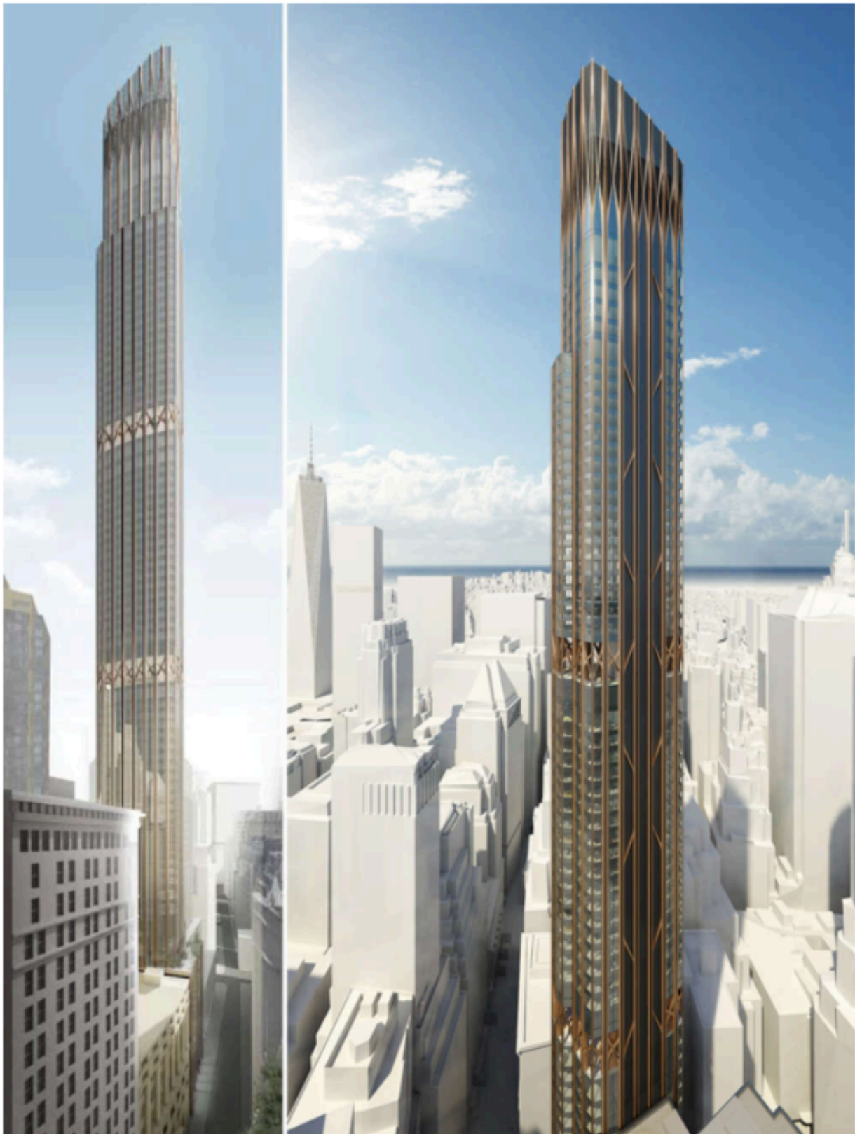
Renderings of 45 Broad Street (Madison Equities / Pizzarotti IBC / Cetra/Ruddy)

The project markets itself as having 86 stories (Trump floors) due to lofty ceiling heights and double-height floors. Reportedly, the average asking price for its homes will be a relatively affordable $2.7 million. Common amenities will include a 60-foot indoor swimming pool, outdoor garden, library, a fitness center, and several lounges and entertainment spaces. The tower is anticipated to open in 2019, though with the foundation having yet begun, that target date sounds optimistic.