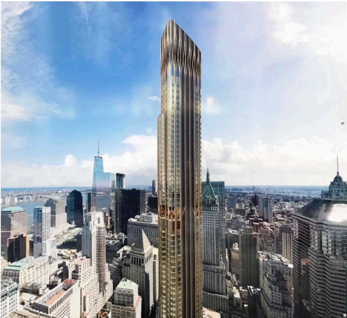
Rendering of 45 Broad Street posted on construction fence

BY ONDEL HYLTON MONDAY, SEPTEMBER 25, 2017