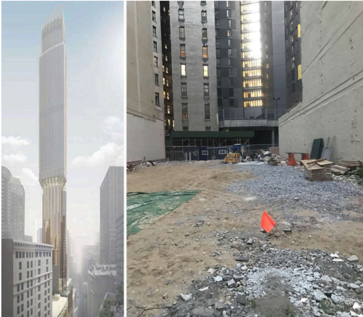
Construction site as of mid-September 2017

CetraRuddy are the architects. The firm is behind several tall towers in Manhattan including One Madison , 200 East 59th Street and Aro . This svelte, feathery tower, however, will be their tallest building yet and resembles none of their prior work— or any other New York skyscraper for that matter. Despite its uniqueness, the tower whispers jazzy Art Deco and pointed Gothic with its thrusting verticality and golden filigree, making it quintessentially New York.